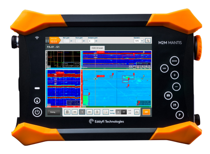
Figure 6: Mantis inspection instrument.