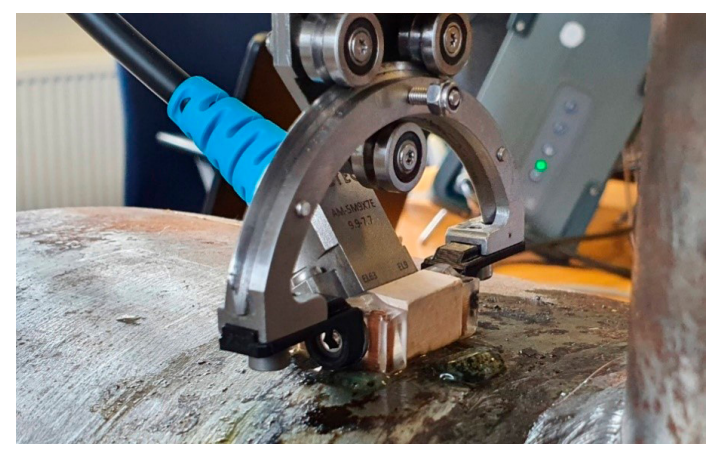
Figure 4: PAUT probe 2D Matrix Array mouted in nozzle scanner