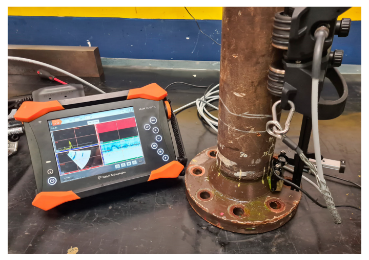
Figure 3: Flange face corrosion assessment with LYNCS and Mantis.