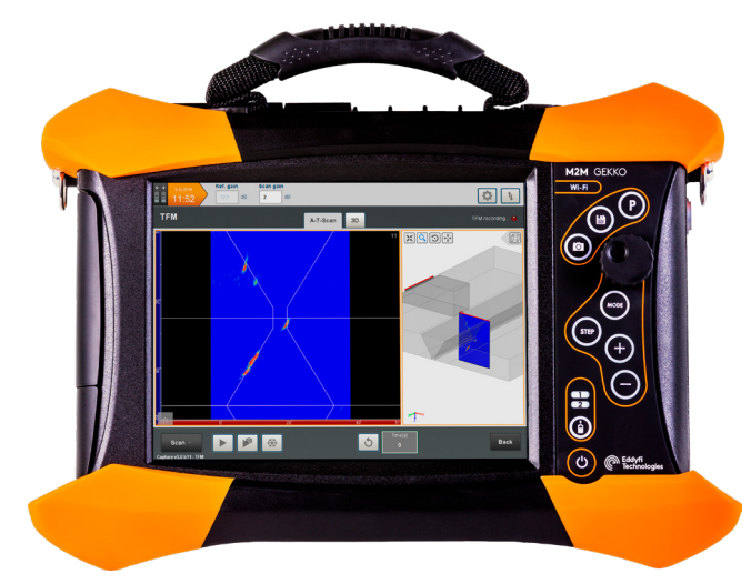
Figure 5: Gekko inspection instrument.