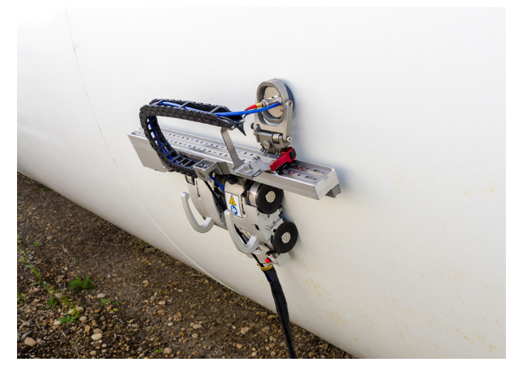
Figure 2: Nav2 Crawler.