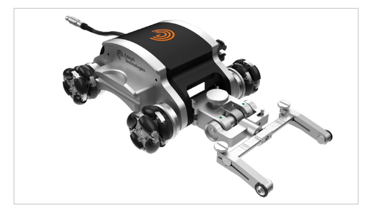
Figure 8: NDT Sweeper.