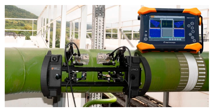
Figure 1: Weld inspection of pipework utilizing LYNCS and Mantis.