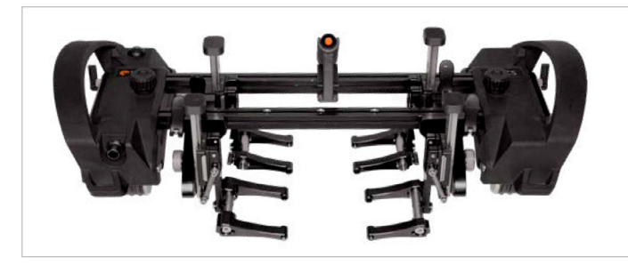
Figure 9: LYNCS WI Weld Inspection Scanner.