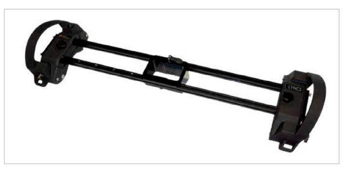
Figure 10: LYNCS CM Corrosion Mapping Scanner.

Selecting the correct equipment and technology is vital to a successful Non-Intrusive Inspection campaign. Combining the Mantis or Gekko with the NDT Sweeper and LYNCS scanner, operators can complete 90% of a vessel and associated pipework inspection.