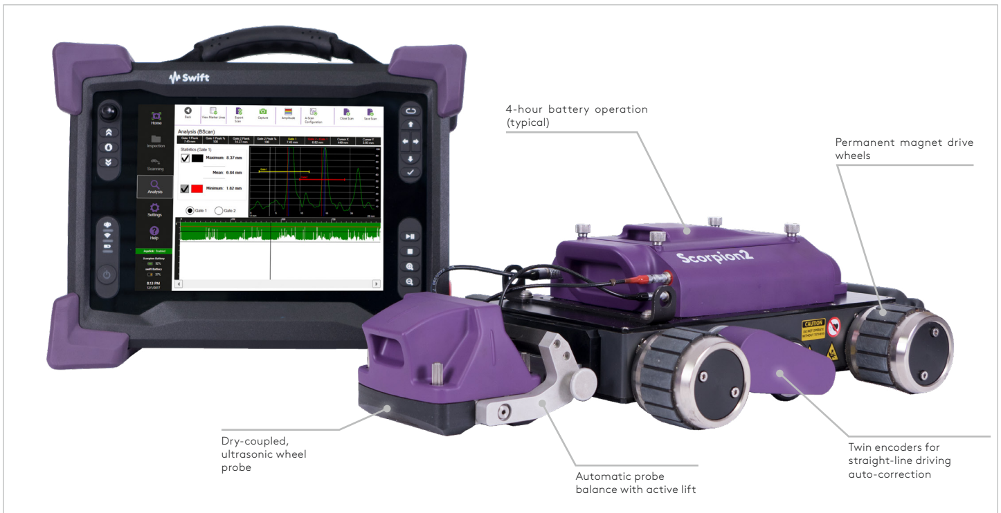
Figure 1: Annotated breakdown of Scorpion2.

An optional harness is also available to support the use of the system for longer periods of time. The adjustable rear stand, the top handle, and the four corner anchor points all make Swift incredibly practical for on-site inspections.