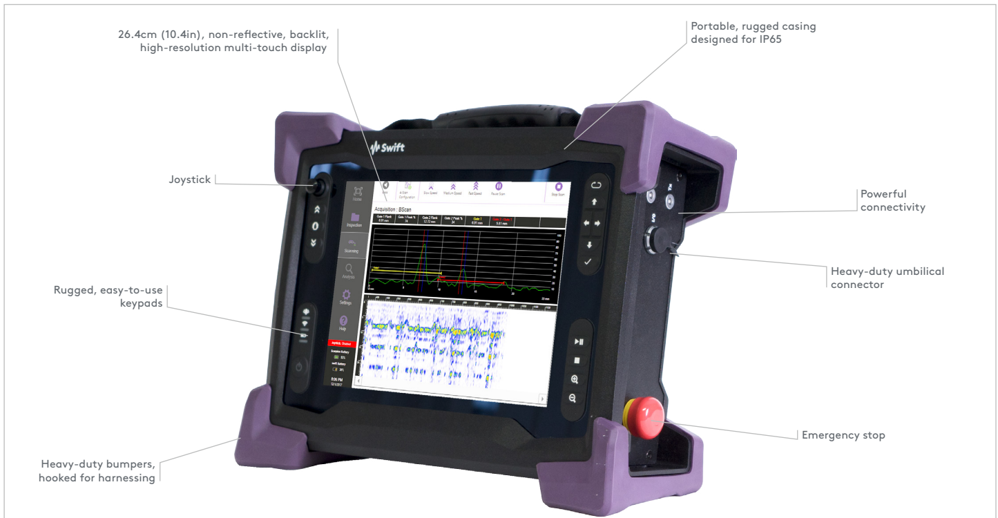
Figure 3: Annotated breakdown of Swift.