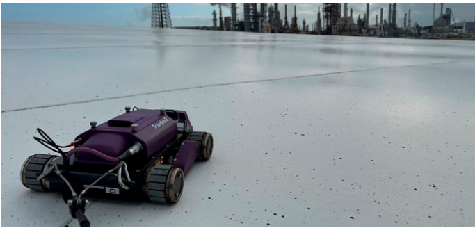
Figure 2: Scorpion2 performing tank roof inspection.

Inspection data can simply be exported as CSV, A-scan and B-scan image, or CMX files which you can import into the CMAP inspection management software. When you do, all the scans are automatically positioned based on X, Y coordinates, providing a complete overview of the inspection.