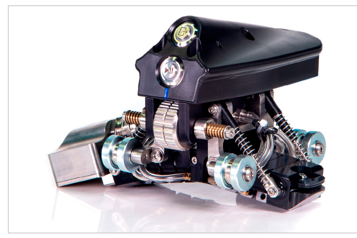
Figure 1: ElbowFlex Scanner for Pipe Elbow Inspection.