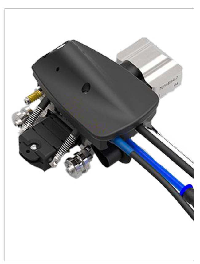
Figure 3: ElbowFlex Scanner for Pipe Elbow Inspection.