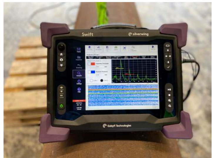
Silverwing Swift Acquisition Device with B-scan showing pipe thickness along cardinal point over six meters

Eddyfi Technologies is best positioned to work internally to create solutions for new problems because we have a broad and experienced, global team who collaborate to create the best possible solution for your operational needs. We fully understand that the inspection landscape is changing and that the scope is becoming wider and wider. With Eddyfi Technologies, you do not need to worry about the future, as we are already looking to solve the problems of tomorrow today.