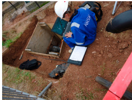
Typical example of buried line installation

A typical application for the system is buried pipelines because of the problems and costs associated with access. Below is a typical application on a buried section of pipes.