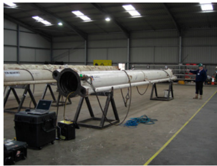
Specimen under test

Unfortunately, no defects were present in the sample, so the sensitivity and detection limits were not tested. Note the low level of noise between 0m and 8m (26.2ft). Signals reflected from the welds and the end of the riser can clearly be detected.